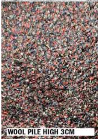
WOOL PILE HIGH 3CM