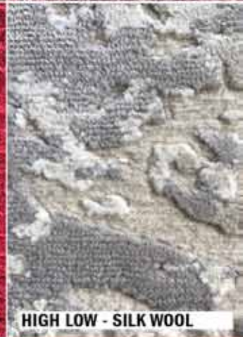
HIGH LOW - SILK WOOL