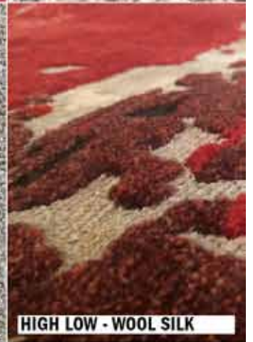
HIGH LOW - WOOL SILK