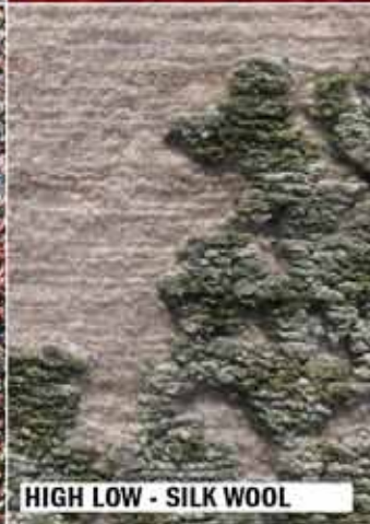
HIGH LOW - SILK WOOL