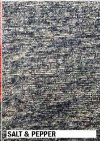
SALT & PEPPER