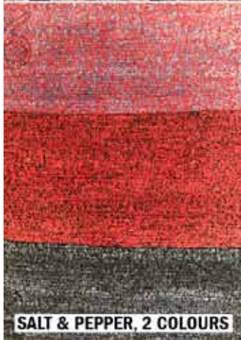
SALT & PEPPER, 2 COLOURS